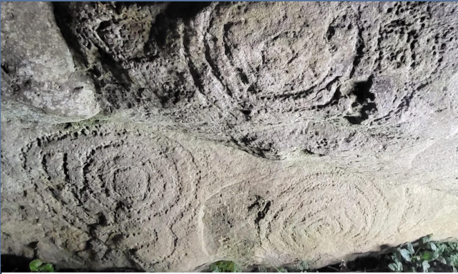
Mystical Knockroe